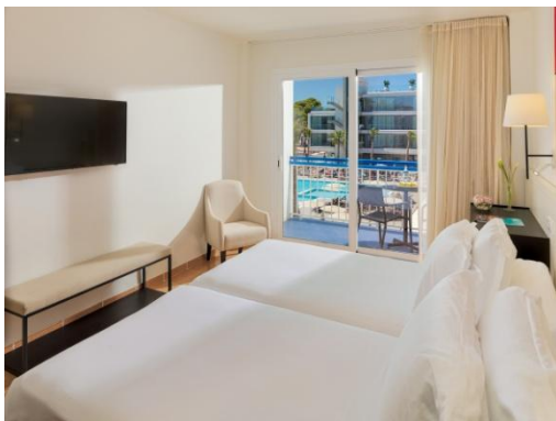
POOL VIEW DOUBLE ROOM

Double Rooms: 22-m 2 rooms refurbished in 2016. They either have views of the interior patio or, for a supplement, street or pool views.