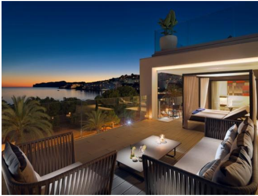
THE QUEEN ROOM TERRACE

Note: the décor, size and views of the rooms may vary depending on the room allocated.