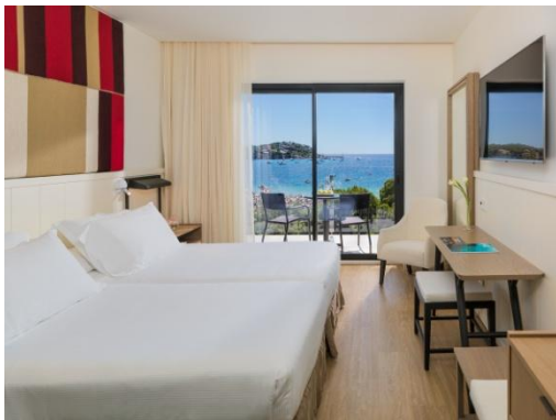
FRONTAL SEA VIEW SUPERIOR DOUBLE ROOM

Double Rooms: 22-m 2 rooms refurbished in 2016. They either have views of the interior patio or, for a supplement, street or pool views.