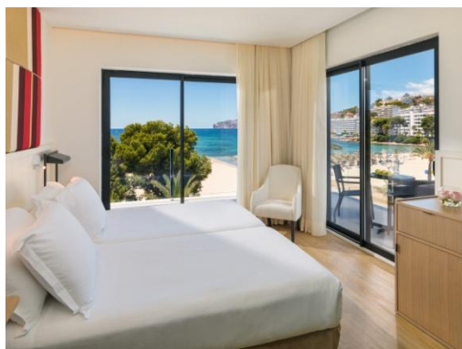
THE CORNER ROOM

Option of rooms with views of the pool or side views of the sea, as well as rooms with frontal views of the sea (with supplement).